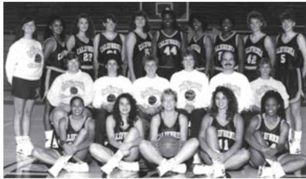
1991-92 NCAA Tournament Qualifying Team