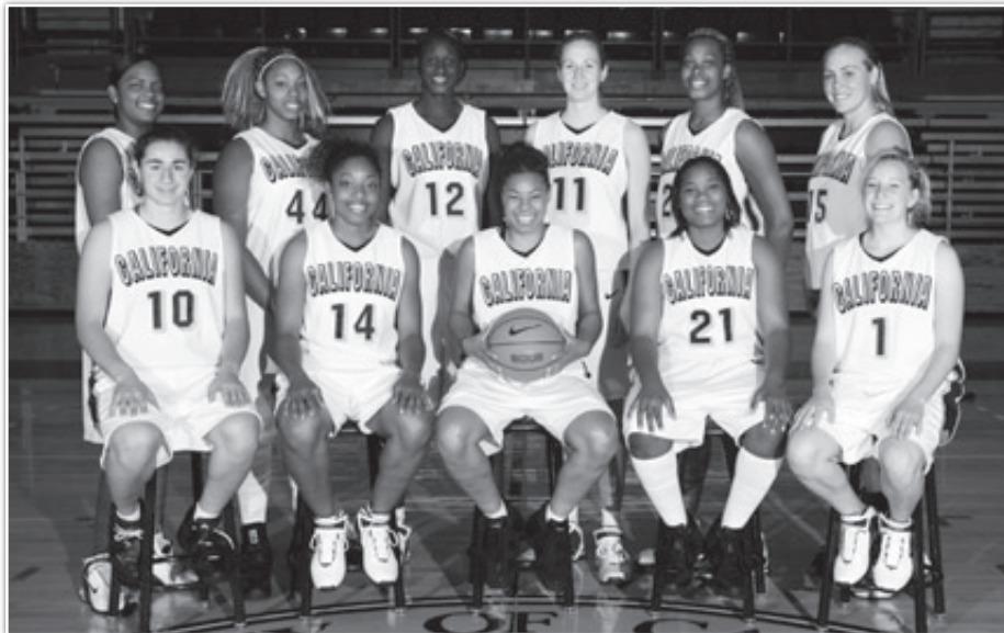
2006-07 NCAA Tournament Qualifying Team