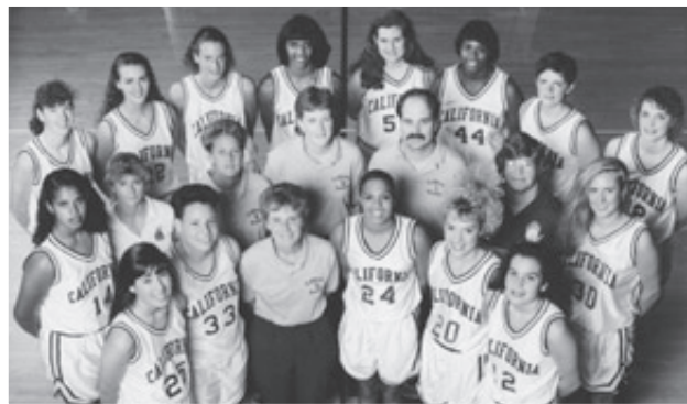
1992-93 NCAA Tournament Qualifying Team