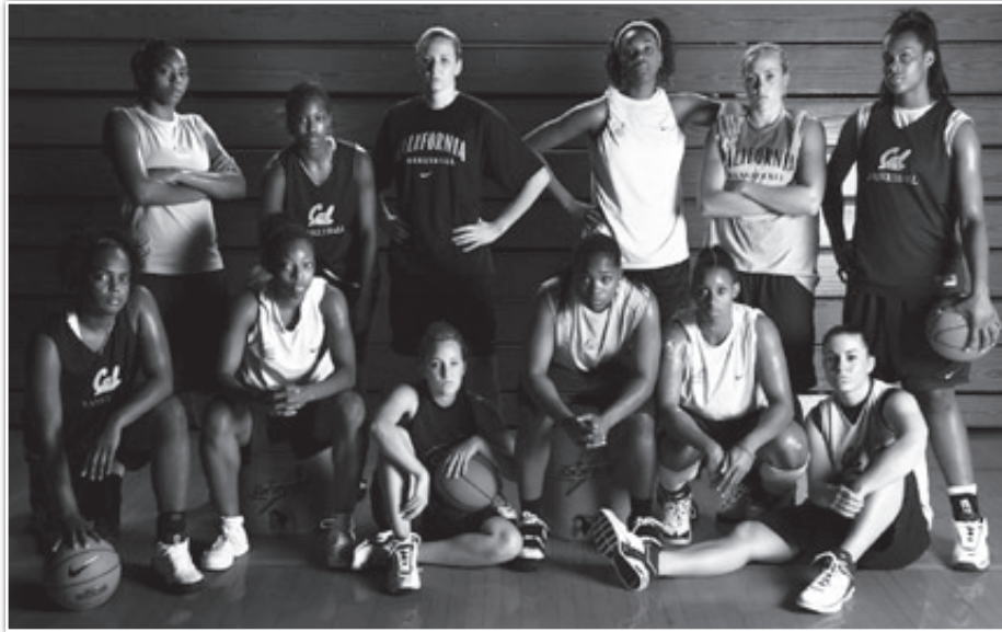
2005-06 NCAA Tournament Qualifying Team