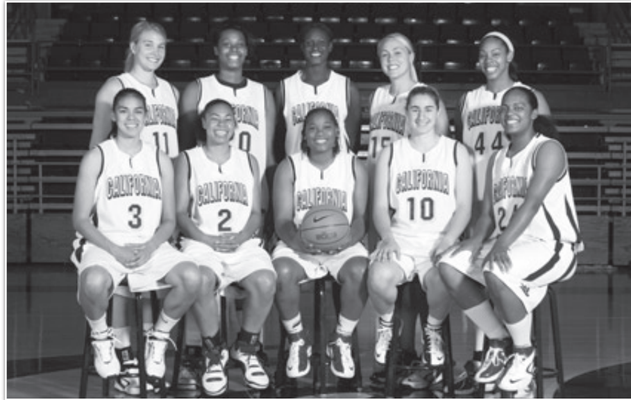
2007-08 NCAA Tournament Qualifying Team