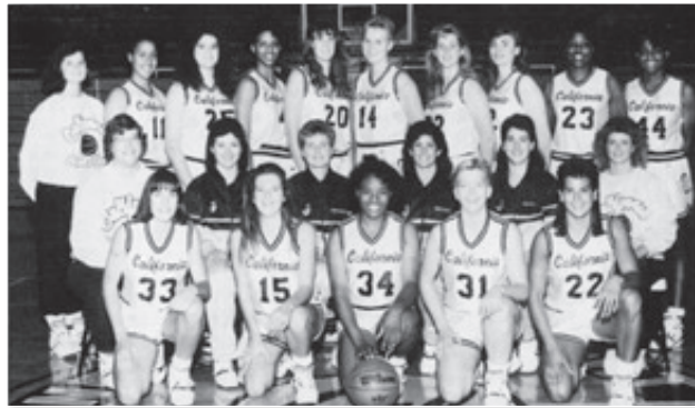
1989-90 NCAA Tournament Qualifying Team